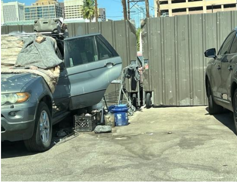
Debris spilling onto the streets and right-of-ways: